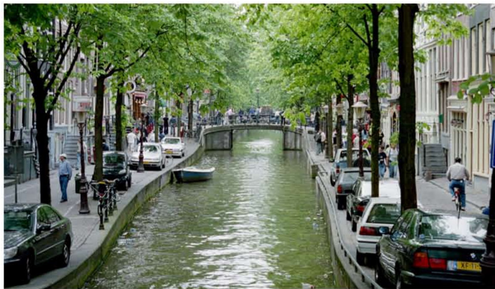
Hight typology: Manhattan