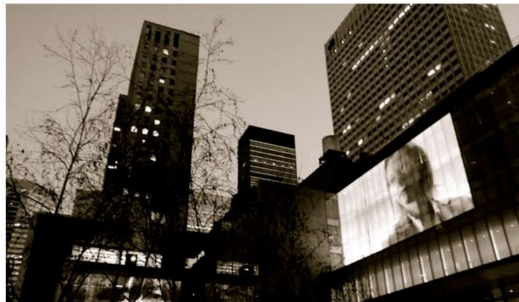
Building typology: Manhattan