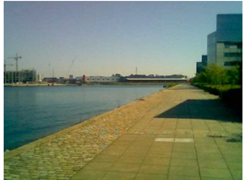
Not a person for miles!

As you can see in the picture they are building residential buildings on Floodgate Islet , 5000 apartments in total -over the next couple of years. This means that this quiet city space is - as they often are -only is a passing thing. Today I was there for about 1 ½ hours and only meet 2 people on foot and 3 in a boat. Not much for (close to) central Copenhagen.