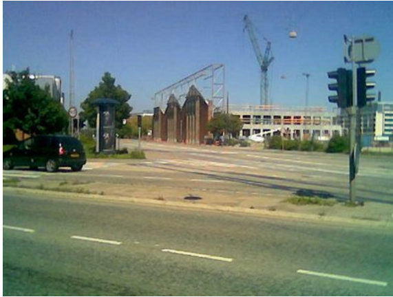
The road going pass the area is: South Harbour Street . South Harbour Street (Shown on the photo) is one of the most heavily trafficked roads in all of Copenhagen.

A series of big office buildings were put up by the waterfront in the late 80ies and early 90ies including companies like Sonofon, Noika, Daimler Chrysler and Ericsson.