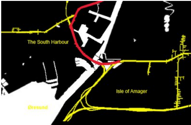
Here you see the situation a bit closer South Harbour Street is the red one.

In my opinion this is one of the sanctuaries of Copenhagen. This is one of the few secret places that still exists in Copenhagen.